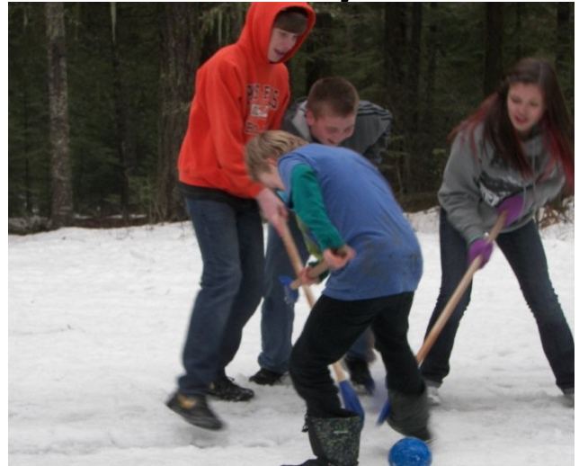
A blast from the past!

9:00 a.m. Worship Service w/ Children's Church 10:00 a.m. Fellowship 10:30 a.m Adult Education 10:30 a.m.. Connect Tweens Time